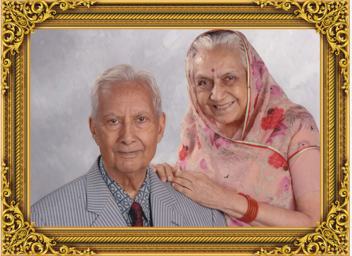
HEAVENLY SYT. BASANT KUMAR BIRLA & HEAVENLY SMT. SARALA BIRLA

"My objective of life is not solely the pursuit of industry, business and trade; for a rich and full life, interest and involvement in Fine Arts, Music, Literature, Social, Cultural and Spiritual activities are essential."