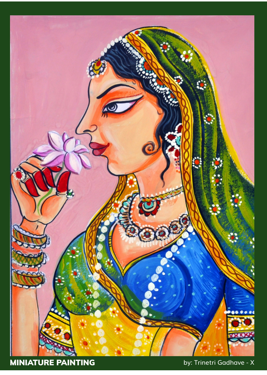
Rajasthan Miniature Painting

Rajasthani Painting, the style of miniature painting that developed mainly in the independent Hindu states of Rajasthan in western India in the 19^{\rm th} century.