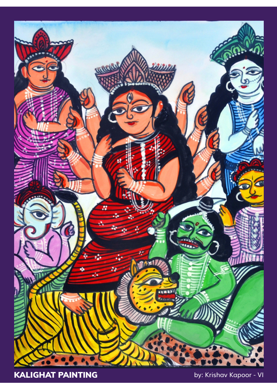
Bengal Kalighat Painting

Kalighat Painting evolved as a unique genre of Indian Painting in the 19th century Kolkata (formerly Calcutta) in West Bengal. From the depiction of Gods.