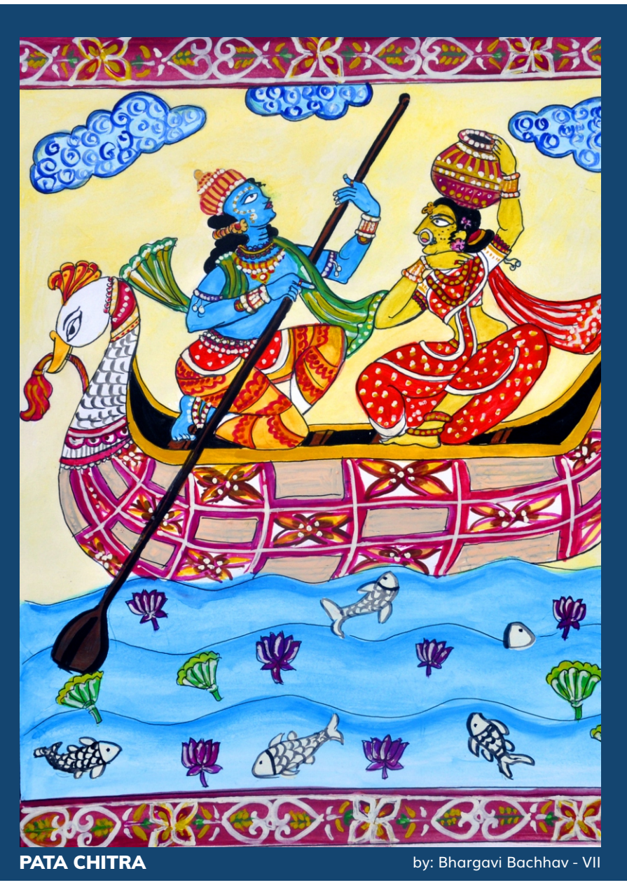
Odisha Patachitra Painting

Patachitra - a Sanskrit word, for the style of Hand Painting that originated in Orissa in 12<sup>th</sup> century B.C. i.e. more than 3000 years ago.