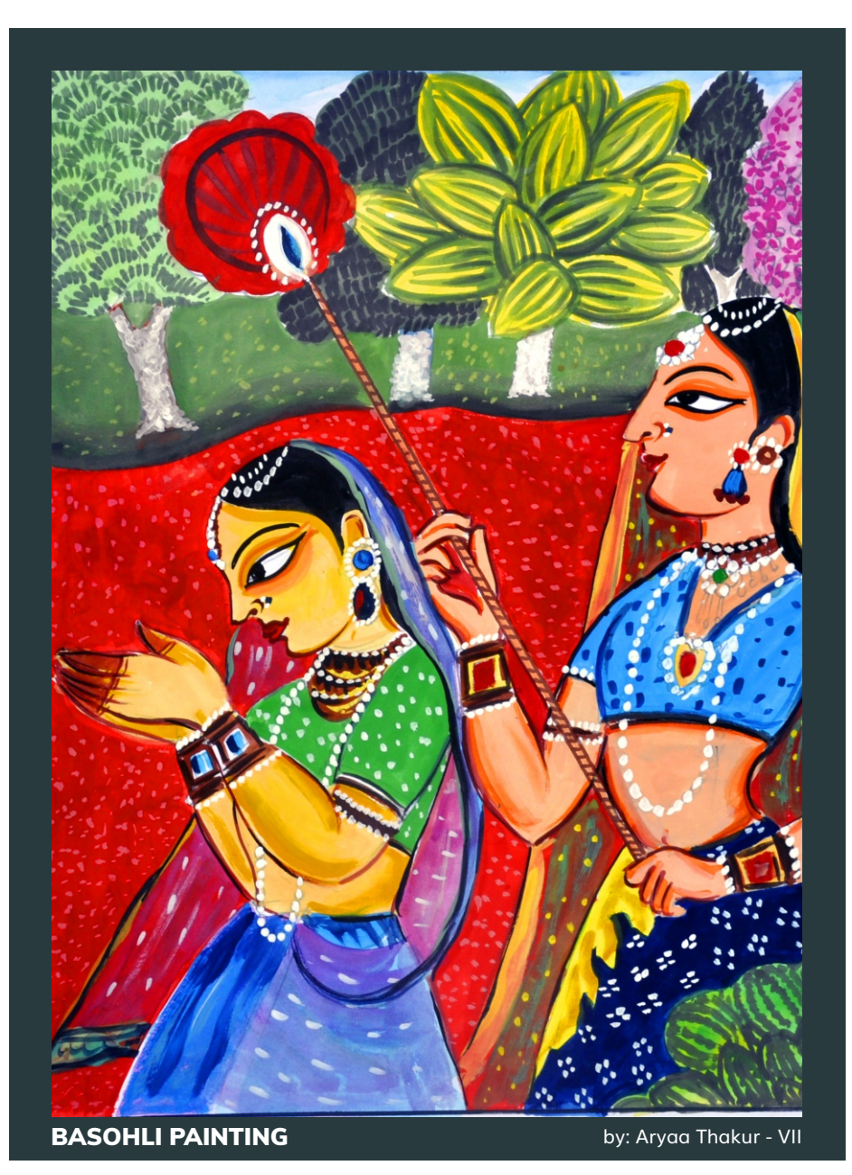
Kashmir Bashoil Painting

The Bashoil idiom, a style that continued at numerous centres until about mid - 18<sup>th</sup> century. It's place was taken by a transitional style sometime refferred to as pre - Kanga.